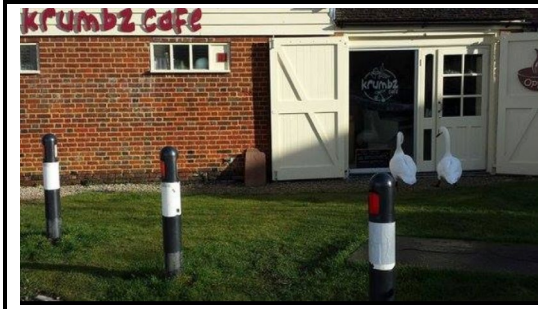
External area – to be licensed with seating.